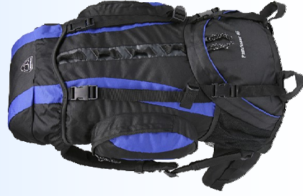
65 litre rucksack

Our young members are supported by almost 100,000 adult volunteers. Adult members of The Association serve as Commissioners (volunteer managers), Leaders, Section Assistants, Administrators, and in many other roles. The support of non-member adults is also welcomed, particularly from parent helpers.